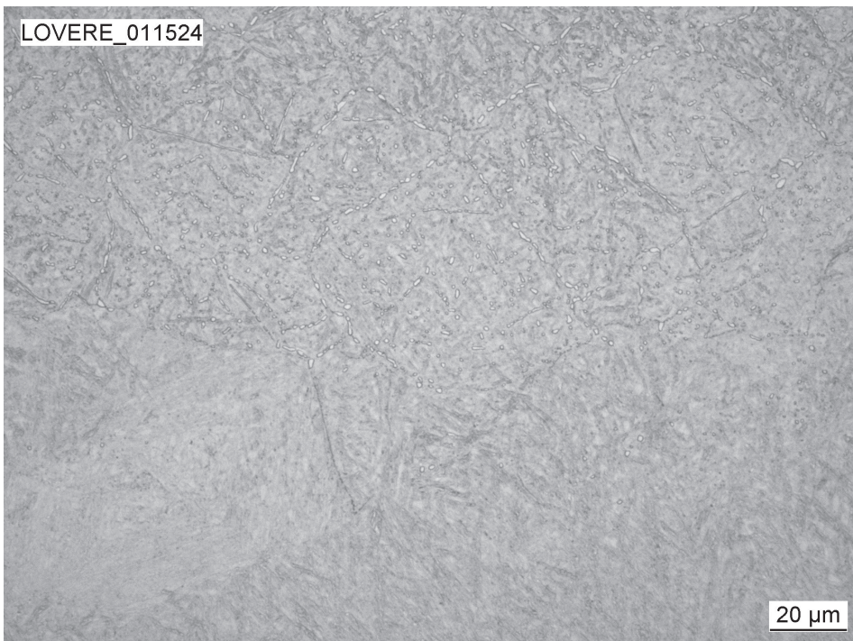
KEYLOS® 2316 in hardening condition: Tempered Martensite with dispersed Carbides